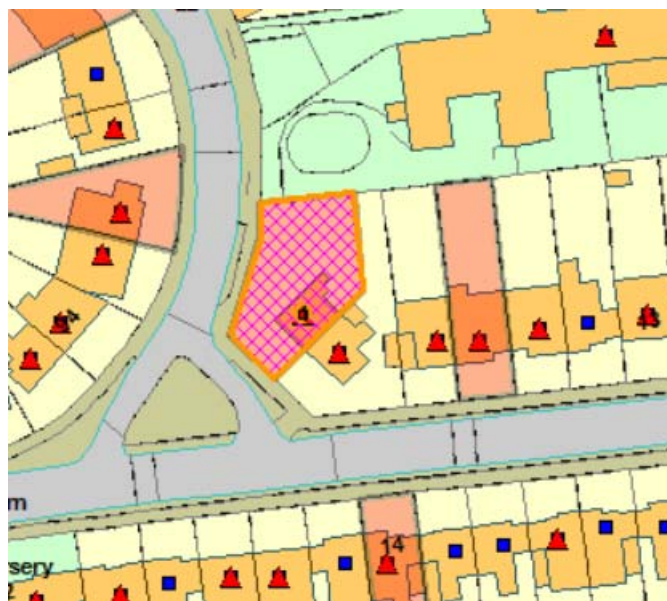
Figure 2: Site Location Plan