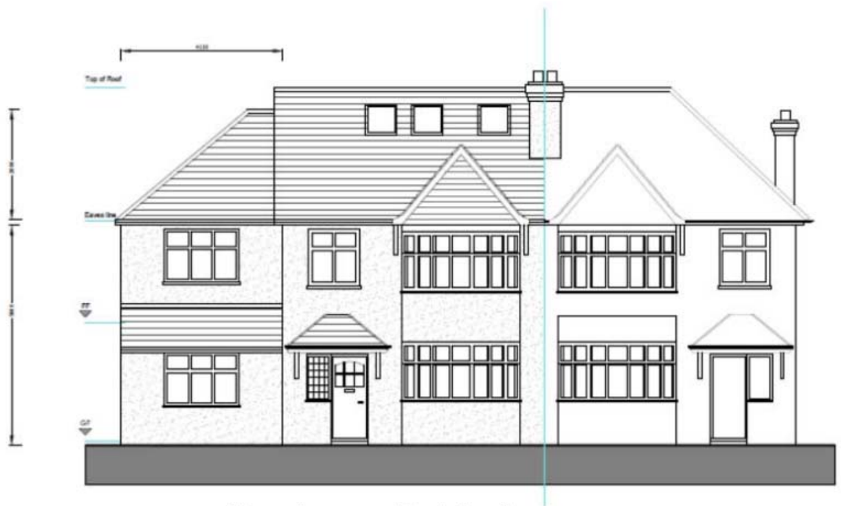
Figure 1: proposed front elevation